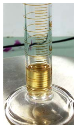
Figure 1. Essential oil extract of lemon cui skin.

Extraction with steam distillation method resulted a yellow gold oil as shown in Figure 1, with weighing 1.8 g and the yield is 0,75%.