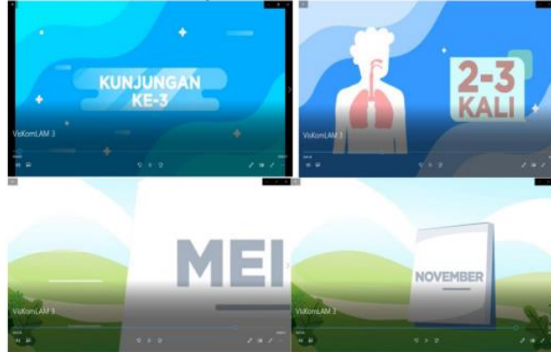
Figure 3. Some of the scripts on VisKomLAM 3

VisKomLAM 3 : At the third sputum examination, after 5 months of treatment. It is mandatory to return after undergoing treatment is complete, because when the treatment is complete, the patient feels that he does not need another examination. In some cases, there are sufferers who require further treatment for two months.