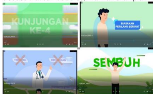
Figure 4. Some of the scripts on VisKomLAM 4

VisKomLAM 4 : At the fourth sputum examination, at the end of 6 months of treatment. It is obligatory to carry out a sputum examination while maintaining a clean and healthy lifestyle. The important thing to overcome the stigma in society is that tuberculosis is a disease that can be cured, "I am an example".