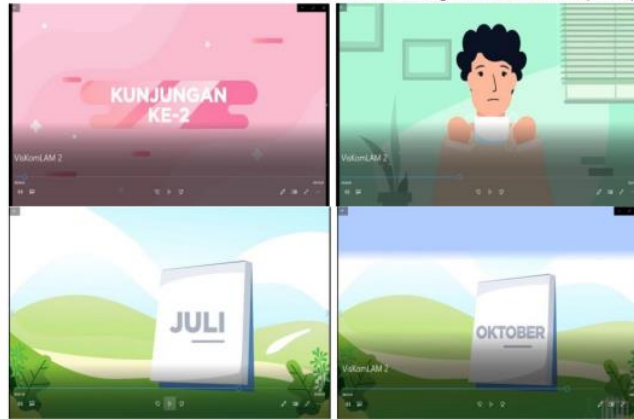
Figure 2. Some of the scripts on VisKomLAM 2

VisKomLAM 3 : At the third sputum examination, after 5 months of treatment. It is mandatory to return after undergoing treatment is complete, because when the treatment is complete, the patient feels that he does not need another examination. In some cases, there are sufferers who require further treatment for two months.