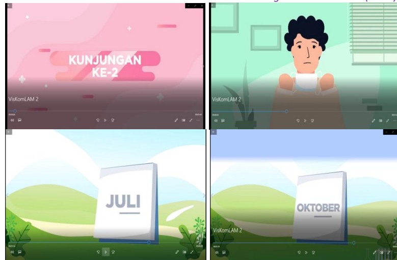
Figure 2. Some of the scripts on VisKomLAM 2

VisKomLAM 3 : At the third sputum examination, after 5 months of treatment. It is mandatory to return after undergoing treatment is complete, because when the treatment is complete, the patient feels that he does not need another examination. In some cases, there are sufferers who require further treatment for two months.