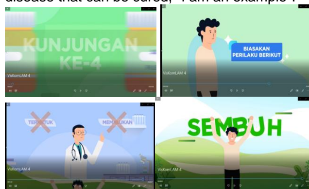
Figure 4. Some of the scripts on VisKomLAM 4

VisKomLAM 4 : At the fourth sputum examination, at the end of 6 months of treatment. It is obligatory to carry out a sputum examination while maintaining a clean and healthy lifestyle. The important thing to overcome the stigma in society is that tuberculosis is a disease that can be cured, "I am an example".