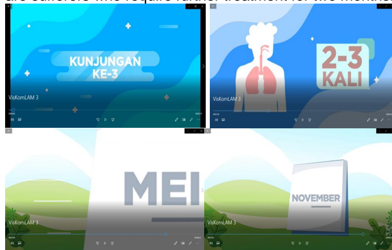
Figure 3. Some of the scripts on VisKomLAM 3

VisKomLAM 3 : At the third sputum examination, after 5 months of treatment. It is mandatory to return after undergoing treatment is complete, because when the treatment is complete, the patient feels that he does not need another examination. In some cases, there are sufferers who require further treatment for two months.