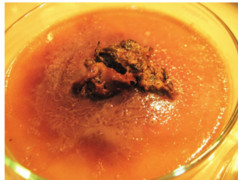
Figure 2. Rhabditiform larvae tracks in Koga Agar Plate

found positive in S. stercoralis infection. Table 1 also shows that the KAP method has a better sensitivity with success rate (efficacy) 68.18% of detect hookworm infection compares to Harada Mori method with success rate of 50%. This result agrees with Reiss et al 18 which found that KAP were superior to Harada Mori methods in hookworm larvae detection. Baermann test were the only method to reach its goal to detect S. stercoralis infection, with only on 1 subject. Examination in multiple diagnostic methods needed to reach a true prevalence due to absence of a gold standard for S. stercoralis detection 14 . Filariform larvae which found in Harada Mori method identified as Necator americanus from its appearance of gap between esophagus and intestine 31 (see Figure 1).